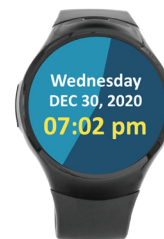
Theora Connect™ wearable with selectable watch faces

The Theora Connect™ wearable for older adults, along with the powerful Theora Link™ smartphone app for families and caregivers, provides a complete solution for communication, remotely monitoring activity, and receiving wandering alerts.